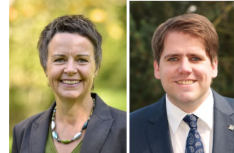
Kirsten Fründt Landrätin

The District Committee is the governing body that deals with current administrative affairs. It prepares resolutions for the District Parliament and creates commissions for the execution of specific tasks. The Committee consists of 14 voluntary councillors elected by the District Parliament and two full-time members.