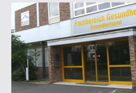
Marburg, Schwanallee 23 Division for Health (Public Health Office)