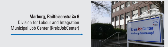
Marburg, Raiffeisenstraße 6 Division for Labour and Integration Municipal Job Center (KreisJobCenter)