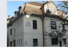
Marburg, Bismarckstraße 16 b Early Childhood and Family Division Division of Local Public Transportation

The seat of the District Administration is located in Marburg-Cappel. There are also several external branches: