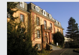
Biedenkopf, Kiesackerstraße 12 Regional Job Center Biedenkopf Division for Participation and Migrant Social Work Office for Vehicle Registration Division for Families, Youth and Social Affairs Adult Education Center