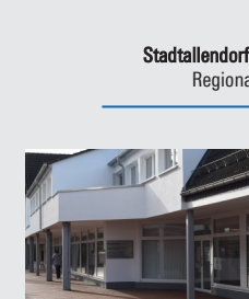
Stadtlendorf, Niederrheinische Straße 3 Regional Job Center Stadtlendorf