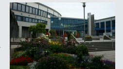
Stadtlendorf, Marktstraße Office for Integration