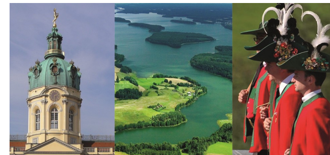
Charlottenburg-Wilmersdorf/Kościerzyna/Lüssen

The district of Marburg-Biedenkopf has official partnerships with the residential area of Charlottenburg-Wilmersdorf in Berlin and the districts of Kościerzyna in Poland and Huntingdonshire in Great Britain. Friendly contact is also maintained with the German districts Nordsachsen (Saxony), Rendsburg-Eckernförde (Schleswig-Holstein) and the Wartburgkreis (Thuringia), as well as with the municipality Lüssen (South Tyrol, Italy).